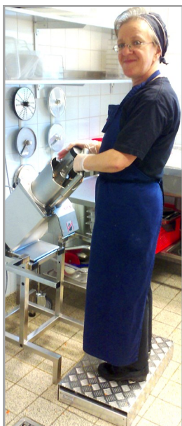
Palle® in preparation area for vegetables with machine hacker