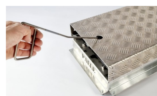
Hook for Palle 800 mm