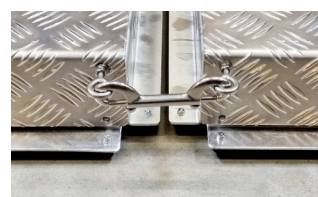
Connect Kit for 2 Palle