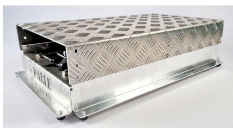
Palle height 160 mm