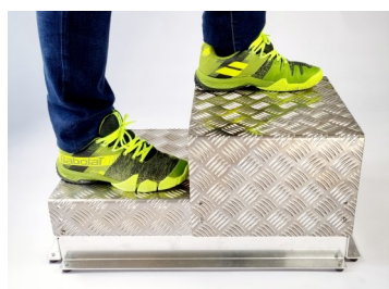
Extra step art 79452

Palle® with accessories; Hook, art 79449 Knobs (instead of screws), art 79450f.