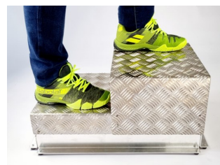
Extra step for Palle