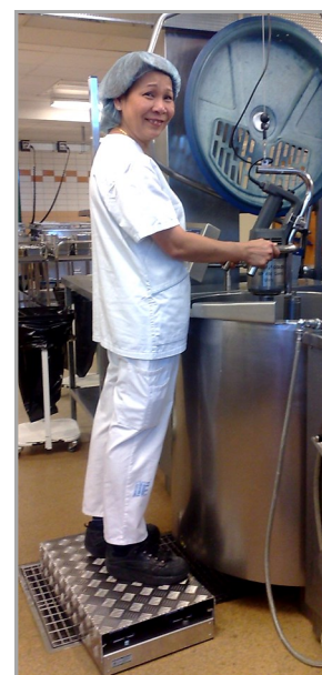
Palle® together with Ergomixer