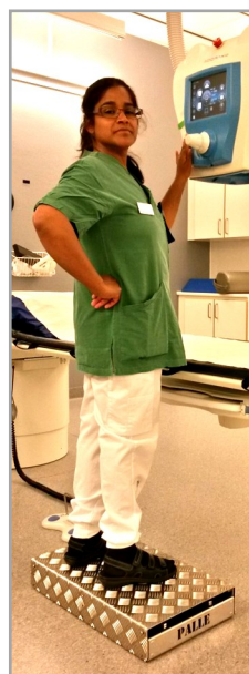
Used in hospital radiology department