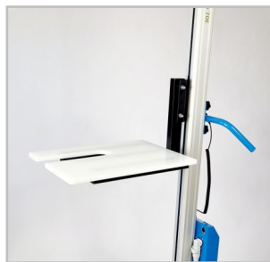
Art 75000M. Platform milk box 510x380x15 mm.