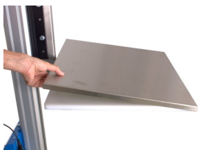
Stainless steel cover platform Art 77225