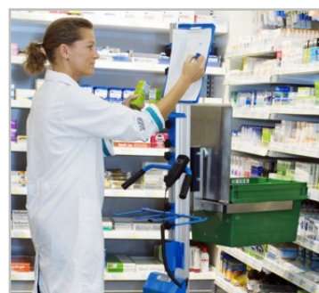
Art 75024 Box lift Pharmacy lift