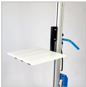
Art 75000S. Platform standard 498x440x15 mm.

A reliable lift trolley that has been manufactured for over 25 years. It has created lift help in thousands of workplaces and industries. Accessories that fit commercial kitchen lifts, hospital lifts, pharmacy lifts, industrial lifts, workshop lifts.