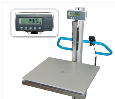
Art 77231 Scale with integrated display