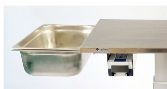
79390g GN1/1 frame