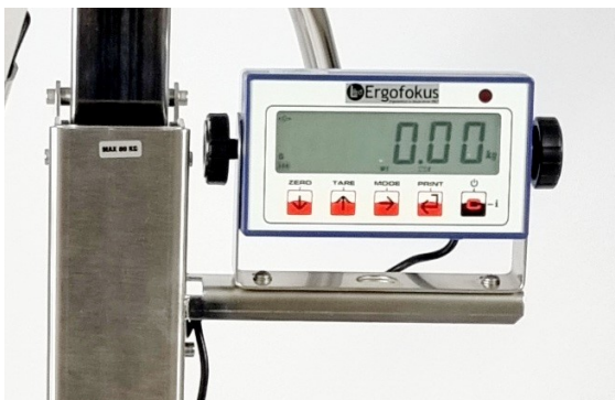
Platform scale control scale. Charged with 12 volt magnetic connector. Washable. IPX5.