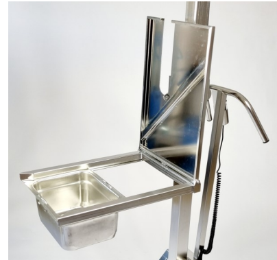
Art. 80060M. LD80 GN fork with folding platform milk outlet.