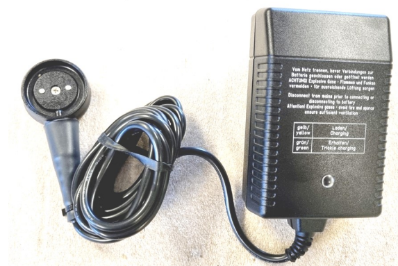
Lift trolley is charged with a 24 volt magnetic contact. Washable. IPX5.