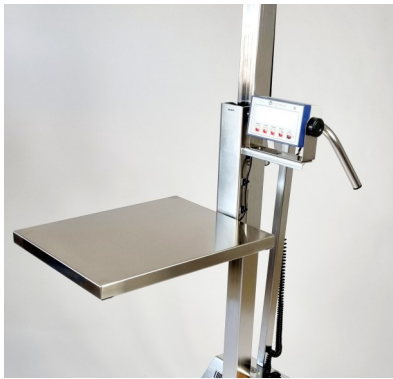
Art 80090. LD80 Platform with integrated scale.

We can also custom manufacture custom-made lifting platforms, different lifting heights and specially adapted chassis and wheels.