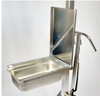
Art. 80060S. LD80 with GN fork with folding standard platform.