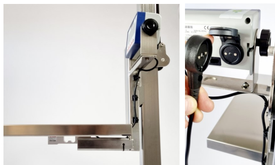
Platform scale control scale. Charged with 12 volt magnetic connector. Washable. IPX5.