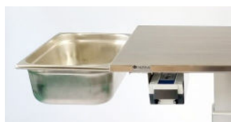
79390g GN1/1 frame